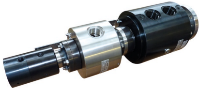
ROTOSTAT E + ROTODISK D10