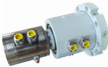
ROTOSTAT E + ROTODISK SW